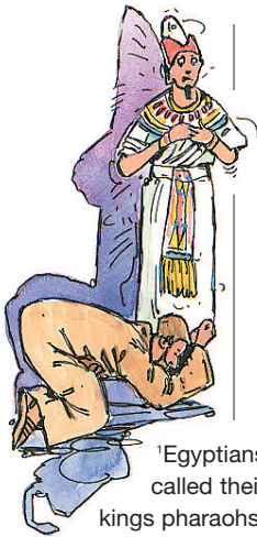
1 Egyptians called their kings pharaohs. Many people believed the pharaohs were gods.

P haraoh 1 decided to make slaves of the Hebrews. They had to work very hard making bricks to build Pharaoh's cities. The slave drivers were mean and often beat them. But the Hebrew people kept growing in numbers.